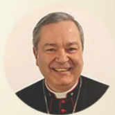
His Excellency Archbishop Santo Marciàno Italy

Celebrant and Homilist of the Opening Mass of the Congress